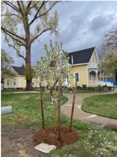
In Memory