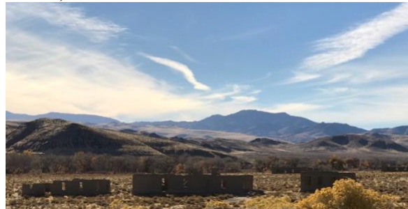
More of Fort Churchill today