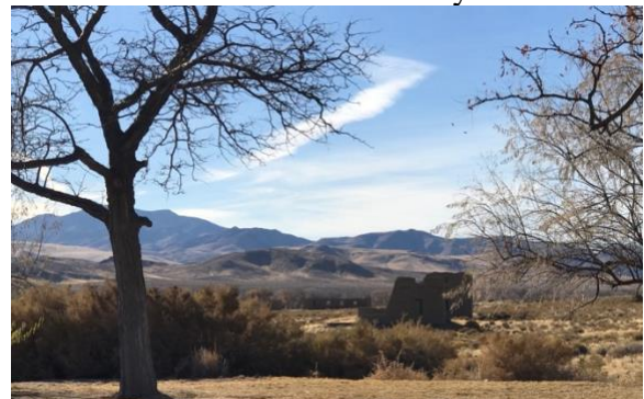
Fort Churchill today