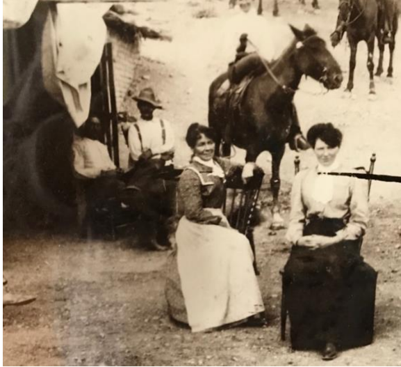
Fashions from the Fort