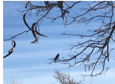
Fort Churchill in the Fall