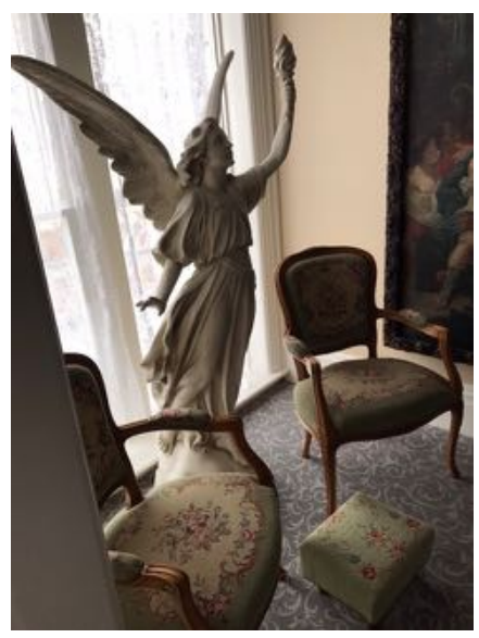
Figure 3: An angel watches over all. She has been placed in the end of the hallway and is a breathtaking statue.