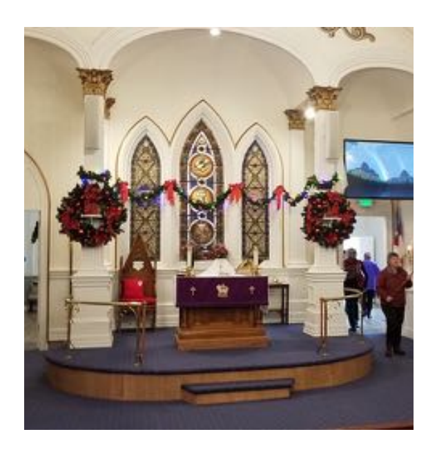
Figure 4: Interior of St. Peters Episcopal Church, one of the Victorian tour locations

In a year that was packed with special events, the Victorian Christmas tour of houses and buildings was one of the best and well-attended programs of 2022. Decorating was done at the Foreman-Roberts House and Carriage House.